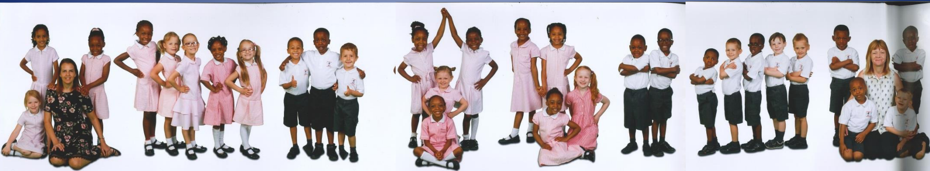
ST THOMAS OF CANTERBURY CATHOLIC PRIMARY SCHOOL 2018