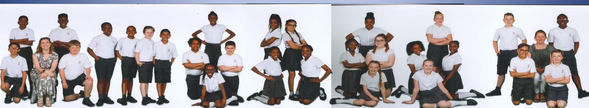
ST THOMAS OF CANTERBURY CATHOLIC PRIMARY SCHOOL 2018